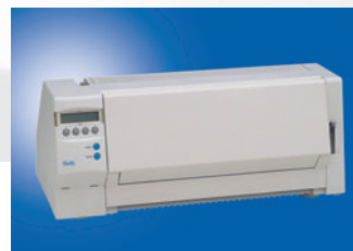
T2240: 9 or 24-wire, narrow carriage