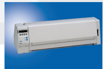
T2340: 24-wire, wide carriage